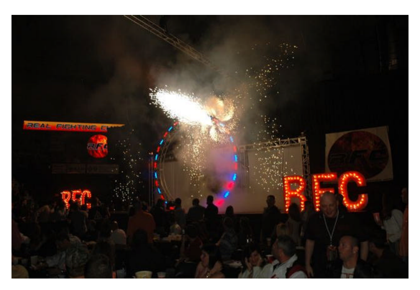
1.4 Air burst, fountian gerbs and a burn sign for the intro of Chuck Liddell "The Ice Man" @ RFC