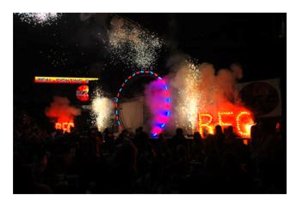
1.4 Air burst, fountian gerbs and a burn sign for the intro of Chuck Liddell "The Ice Man" @ RFC